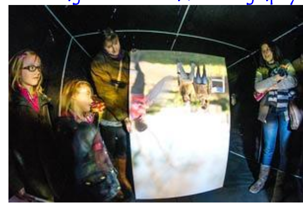
The Magic of Victorian Photography

One day only: Thu 15 Feb, 10am to 12.30pm and 1.30 to 4pm, £5 (PARENT / CARER FREE)