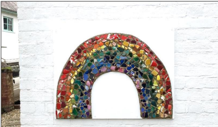
We made this rainbow mosaic from broken crockery we found on a path on our way to Shillingford Organics.

Some of you let me know how much you enjoyed the whimsy of Barbie and Ken’s wedding. I could not resist the sequel “Go Skipper you can do it”, when Barbie’s sister, Skipper, takes on the challenge of abseiling!