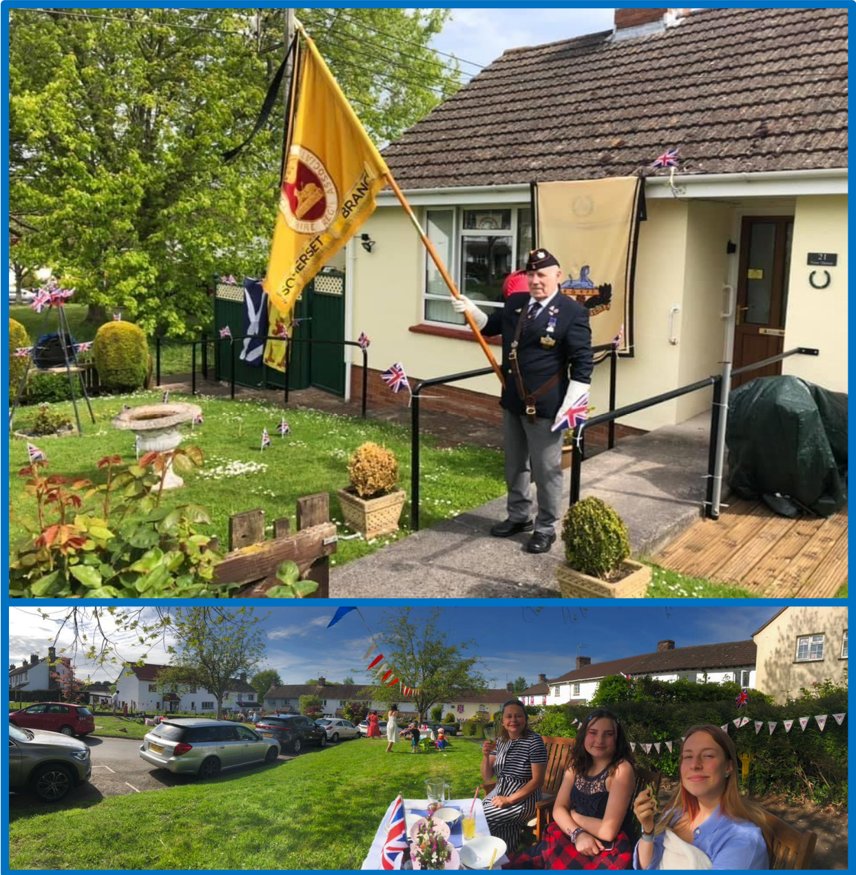
Victory in Europe Day celebrations in the Hams – Socially distanced of course!