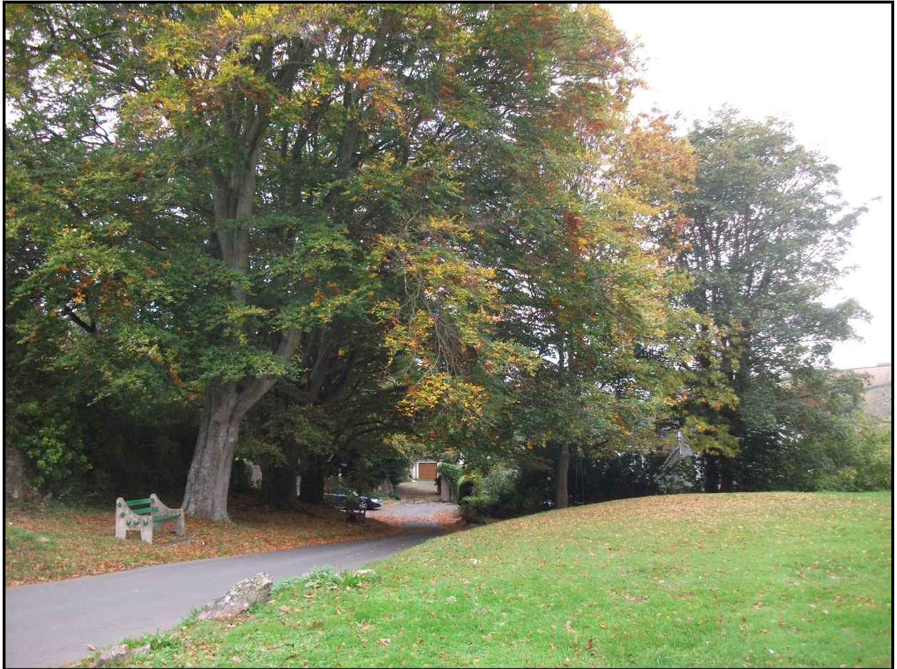
The beech trees beside the village green show the colours of autumn.