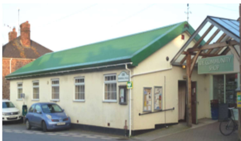
IDE MEMORIAL HALL

You will be pleased to know that although the hall is hardly being used at the present it is still being looked after – the boiler and fire extinguishers have been serviced, the electricity and gas bills paid, and also the insurance on the hall. Although the present income is negligible, the hall has a reasonable amount in the bank thanks to a grant from Devon County Council. It is hoped that it won't be too long before organisations are able to meet again.