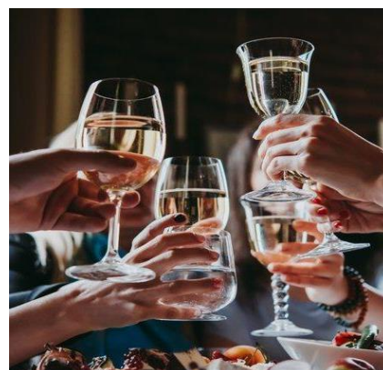
Here's to you, Alan

To coin the well-used phrase – gone but definitely not forgotten .