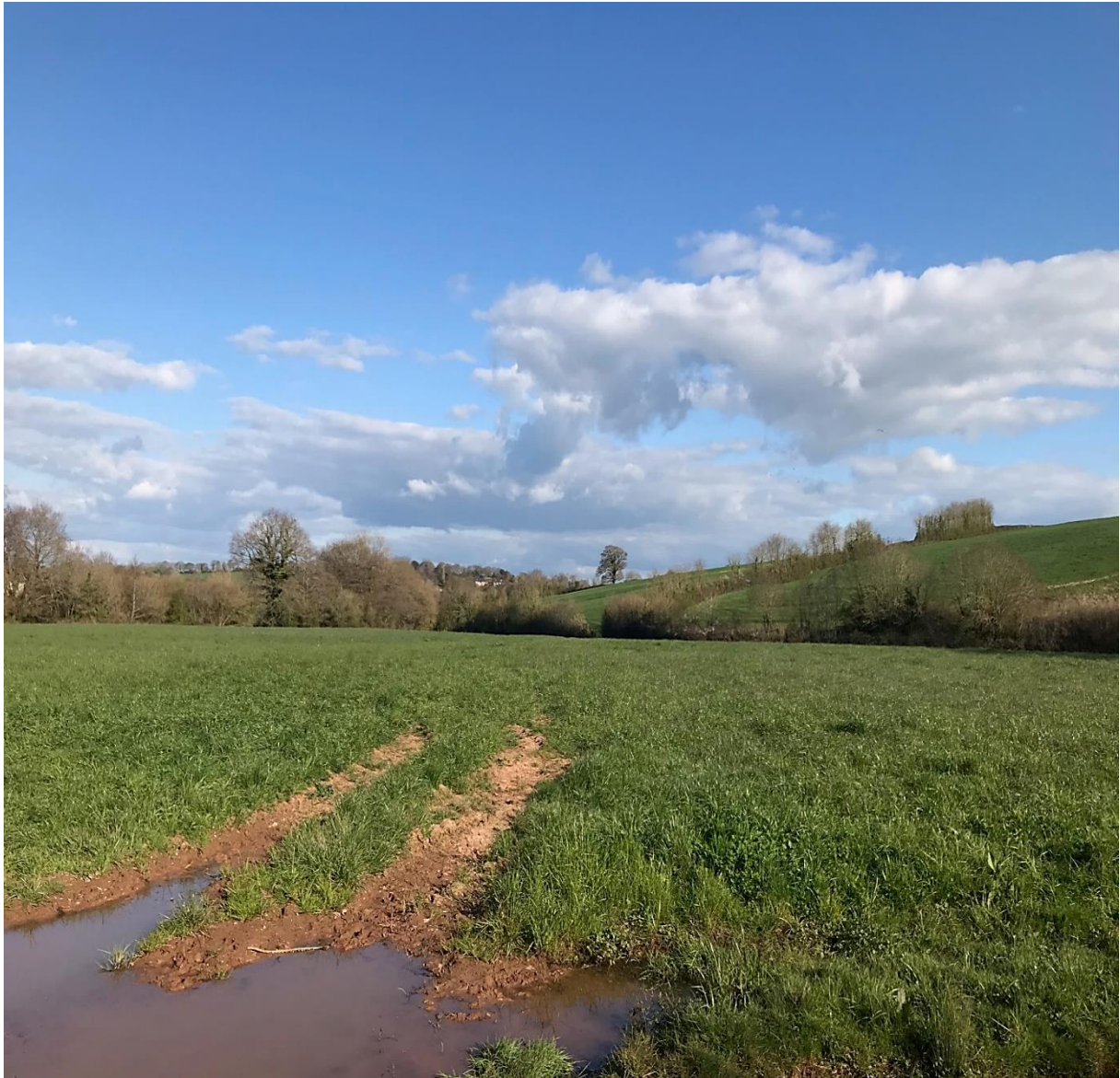
Weir Meadow looking north to the Northern Fields