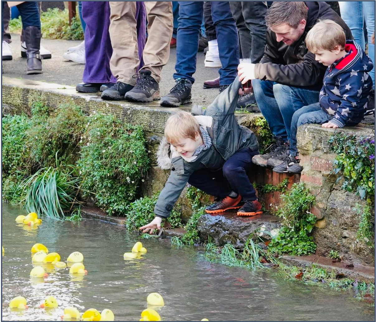
Retrieving a duck at the Boxing Day Duck Race