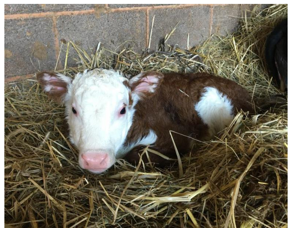
Calf born on 17th March 2022.

From April we will be opening one of our farm spaces opposite the shop as a Rest Stop. Everyone is welcome at the Rest Stop, especially our trail walkers and shop customers! Sit down, enjoy the farm atmosphere, help yourself to tea and coffee, eat your sandwiches or buy snacks or ice cream from the shop. We hope to see you soon!