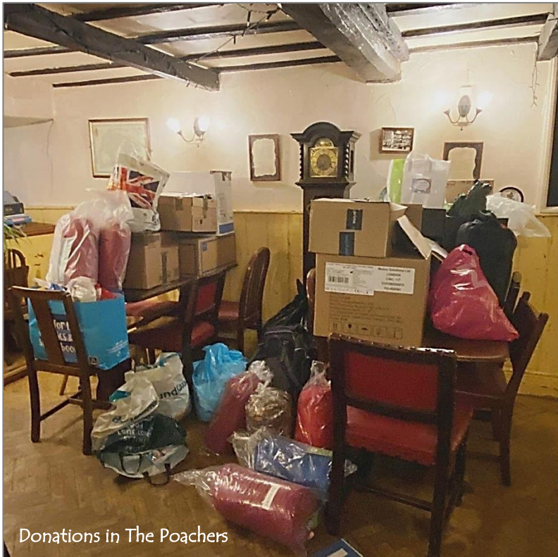
Donations in The Poachers