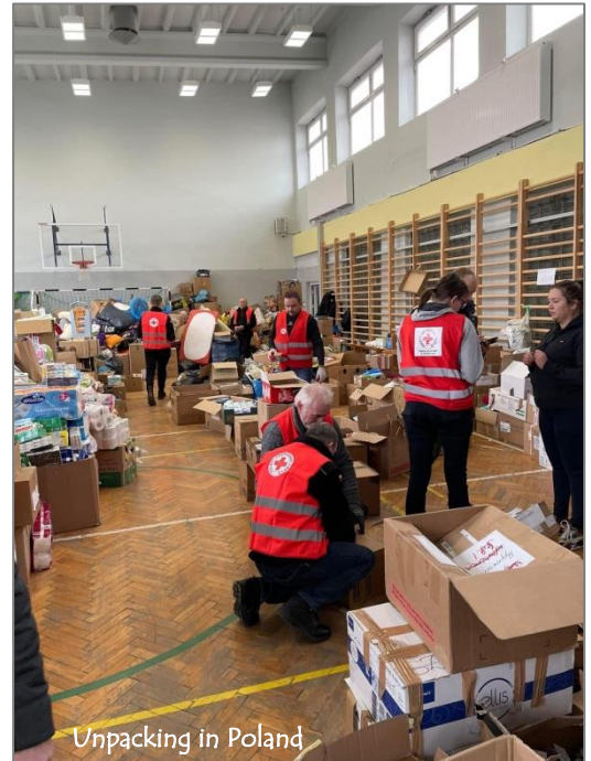
Unpacking in Poland