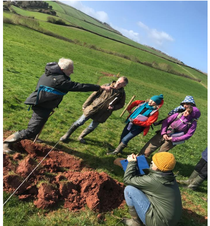
The farm team enjoying a recent training day on soil health.