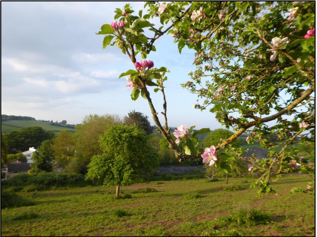
Apple blossom in Ide Orchard