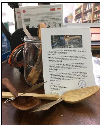
Photo of locally produced spoons made at Pocombe Bridge from wood from the local hedgerows

and photo of Kat's ceramic hearts made at the top of the village – both available in the shop.