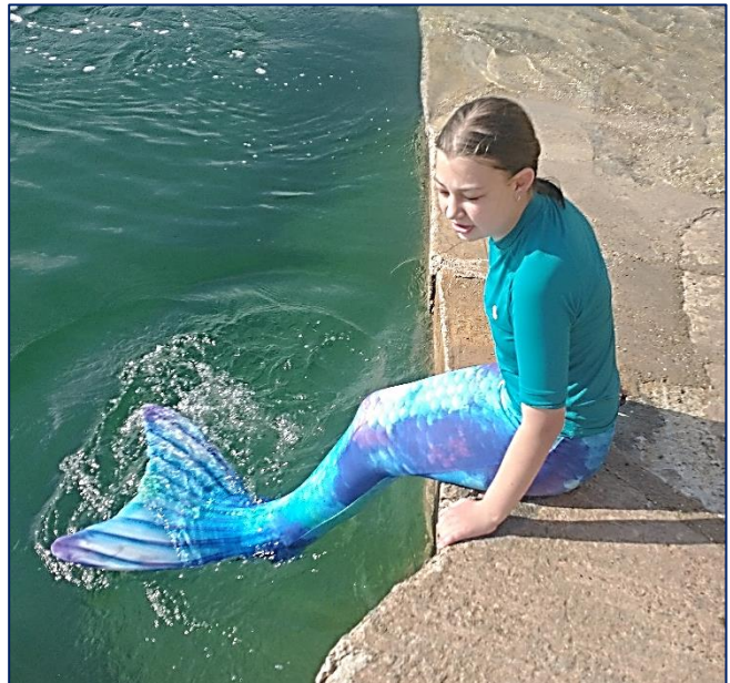
How nice to see a mermaid at the seaside!