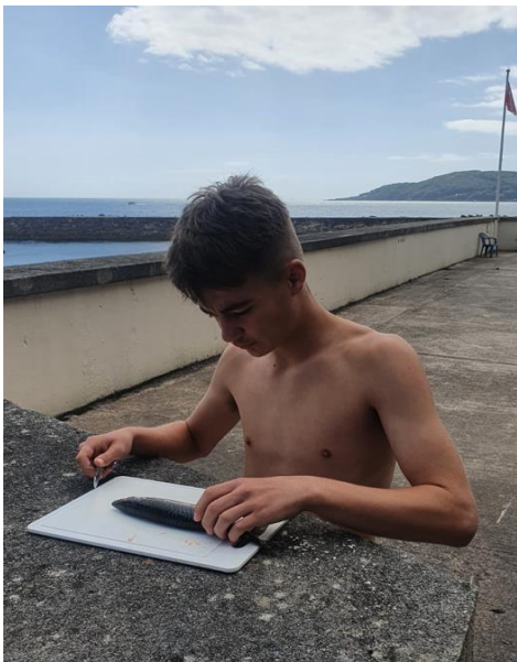
Their grandson learning how to gut A freshly caught mackerel.