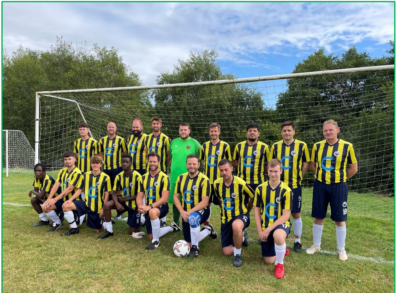
Ide Green Rovers (see page 15 for further details)