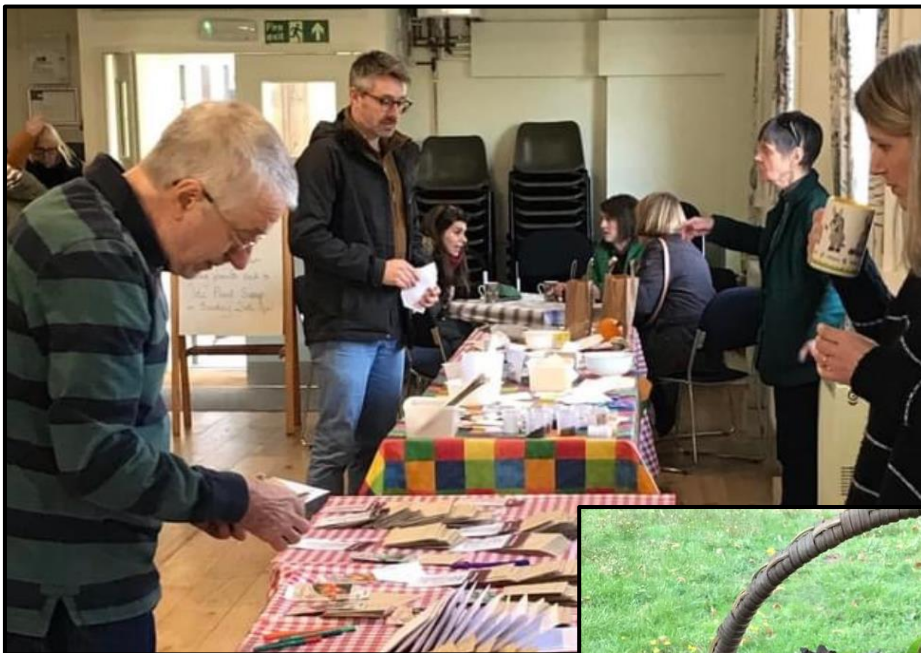
Seed Swap 2022