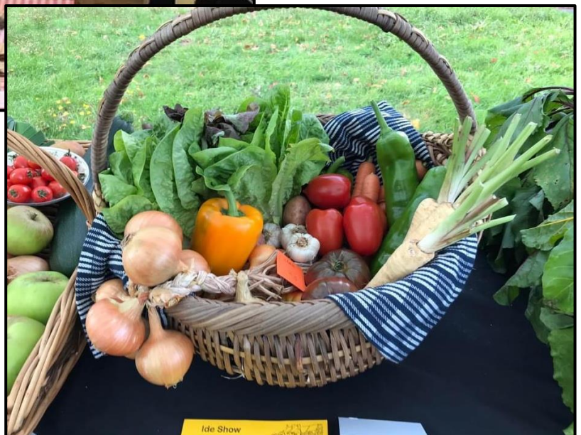
Produce Show 2022