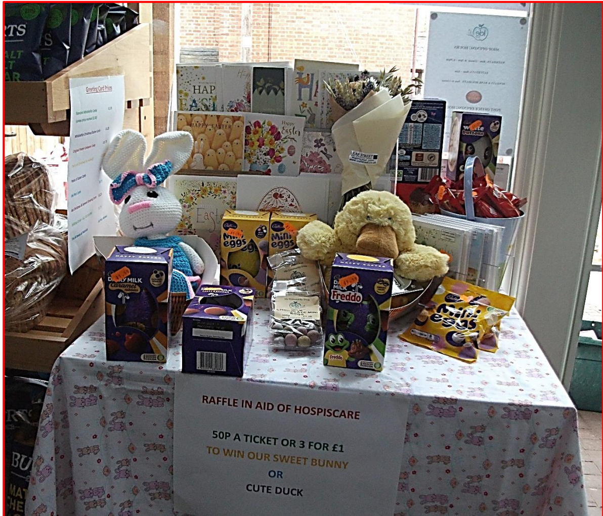
The Easter Display of chocolates, cards, raffle prizes, etc. In our Community Shop