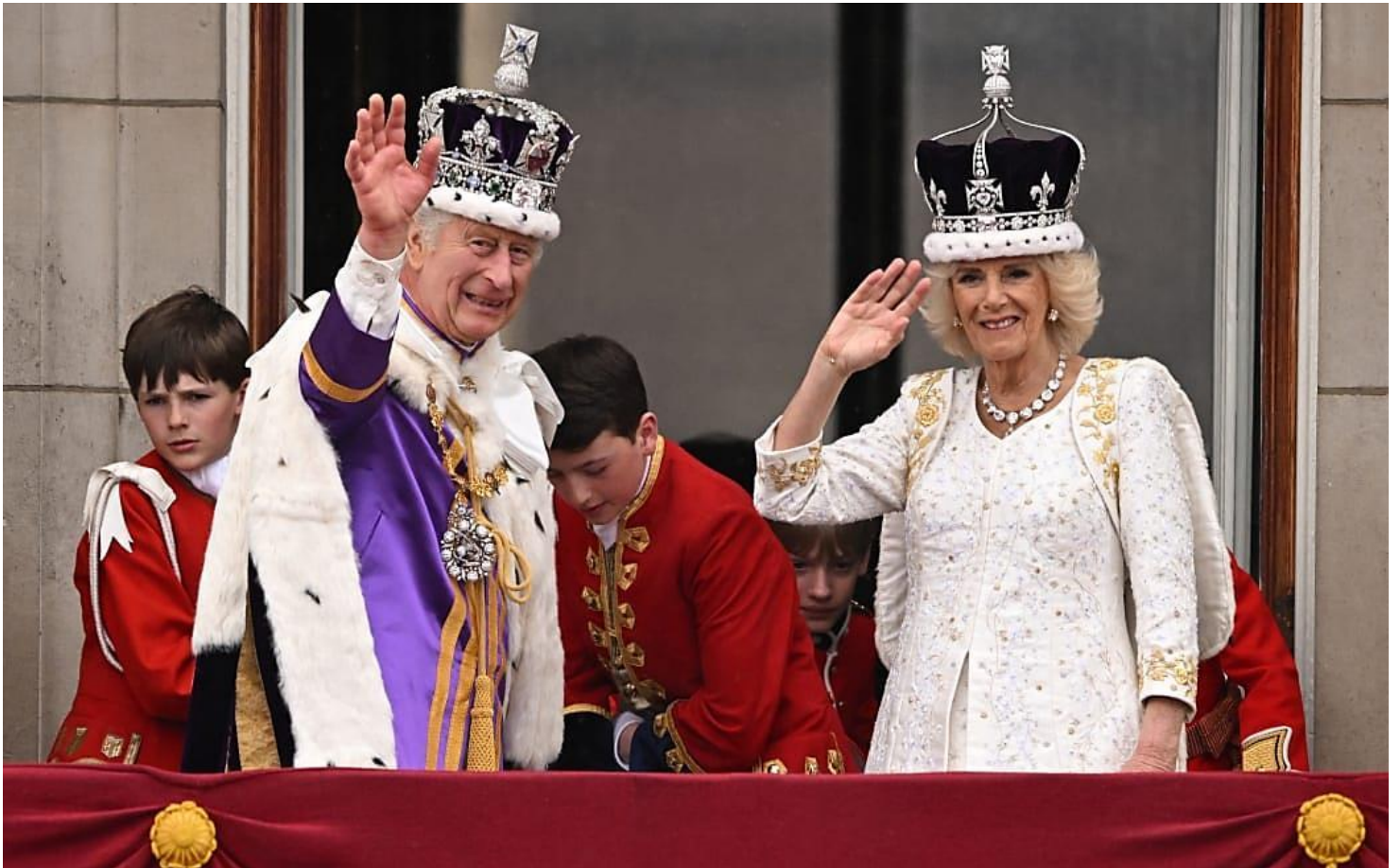
King Charles III and Queen Camilla