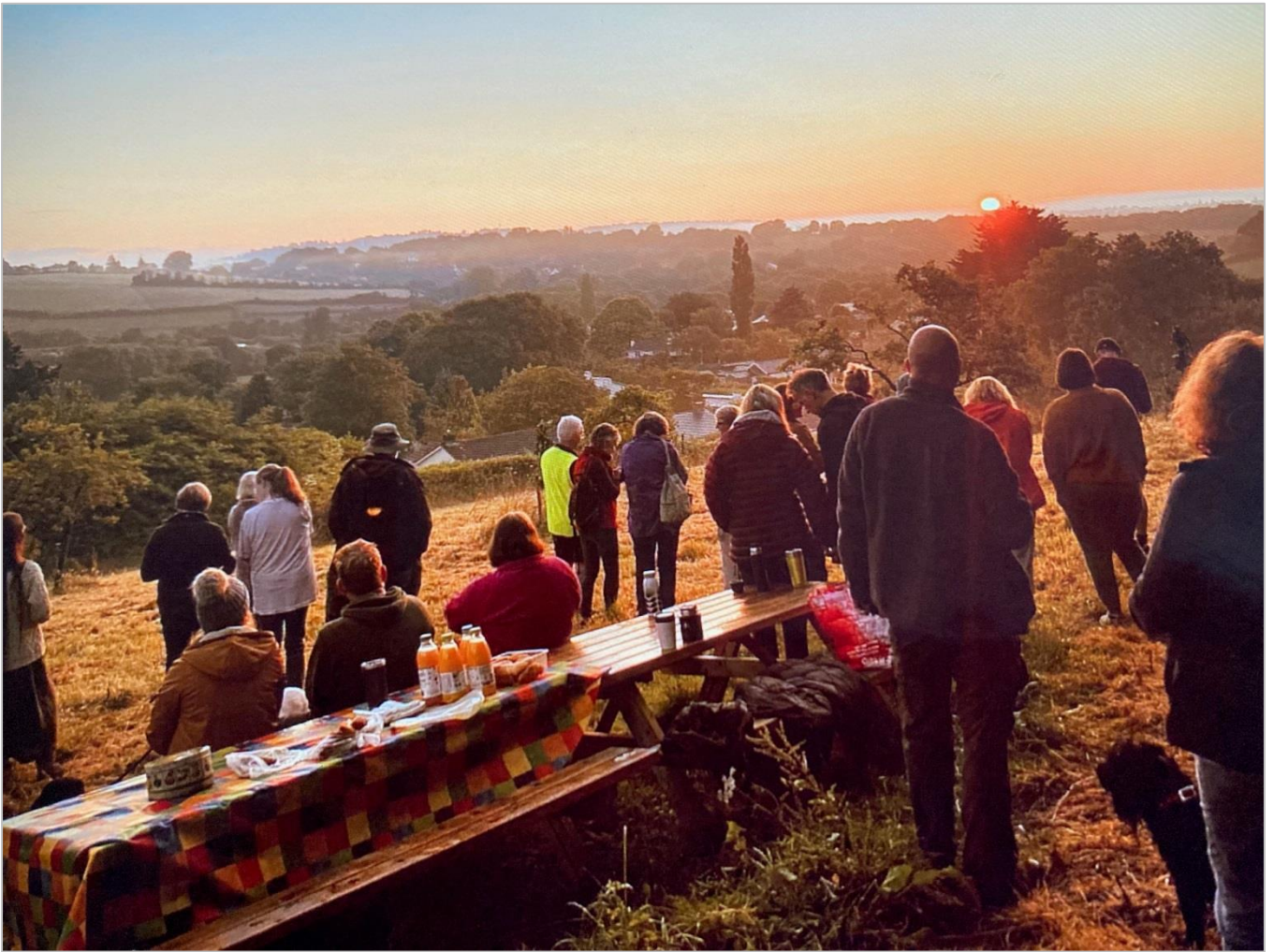
Summer Solstice in Ide Community Orchard (more on page 5)