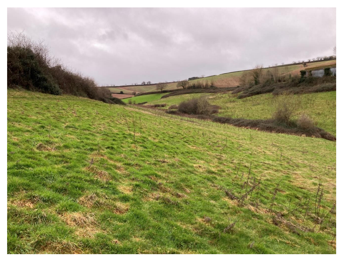
Figure 13- Vegetated valley bottom

Due to the nature of the steepness of the land and the sensitive receptors below the fields, it is suggested that the land manager reassesses how the fields in question are managed in the future taking into account timeliness of ground works, crop choice and rainfall risk.