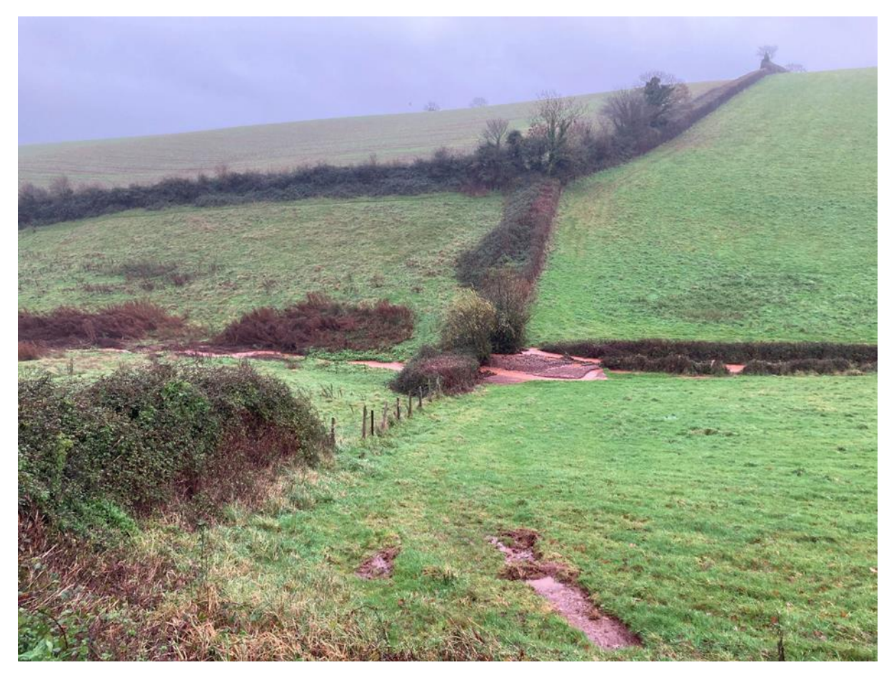
Figure 12- Sediment deposition