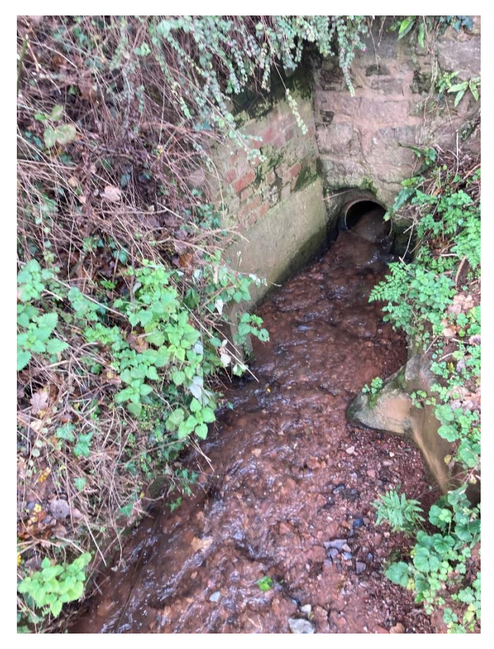
Figure 1- Culvert south of Ide

A culvert (Figure 1) which collects the water from a tributary to the south of Ide and passes below houses and the road where it connects to the Fordland Brook. This culvert became blocked with debris and rubble during the storm event, overtopping and flooding the adjacant property.