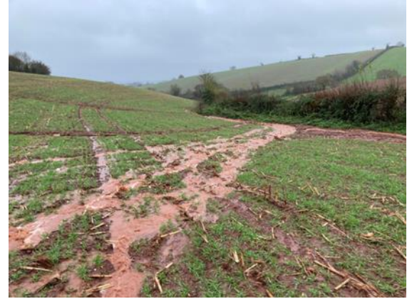
Figure 6- Picture showing overland flow in field 2