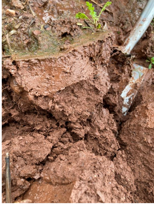
Figure 7- Soil profile

The previous crop was an arable cereal where the stubble had been direct drilled to establish a grass crop, however this crop had failed to establish. There were two areas noted that where accepting significant highway water, this water was not accepted by the soil and travelled following the natural overland flow path through the catchment. The soil had a sealed soil surface where algal growth was developing, indicating poor water infiltration into the soil profile. This sealed soil surface also showed evidence of overland flow. From approximately 0-20 cm there was a poor dense, blocky soil structure, where evidence of smearing had been caused from the direct seed drill (Figure 7). There was limited evidence of biological activity. From 20-40cm (figure 9) there was also a dense blocky and angular structure that would not support good water infiltration. The soil was noticeably dryer at depth than the soil on the surface, showing the water on the soil surface was perched.