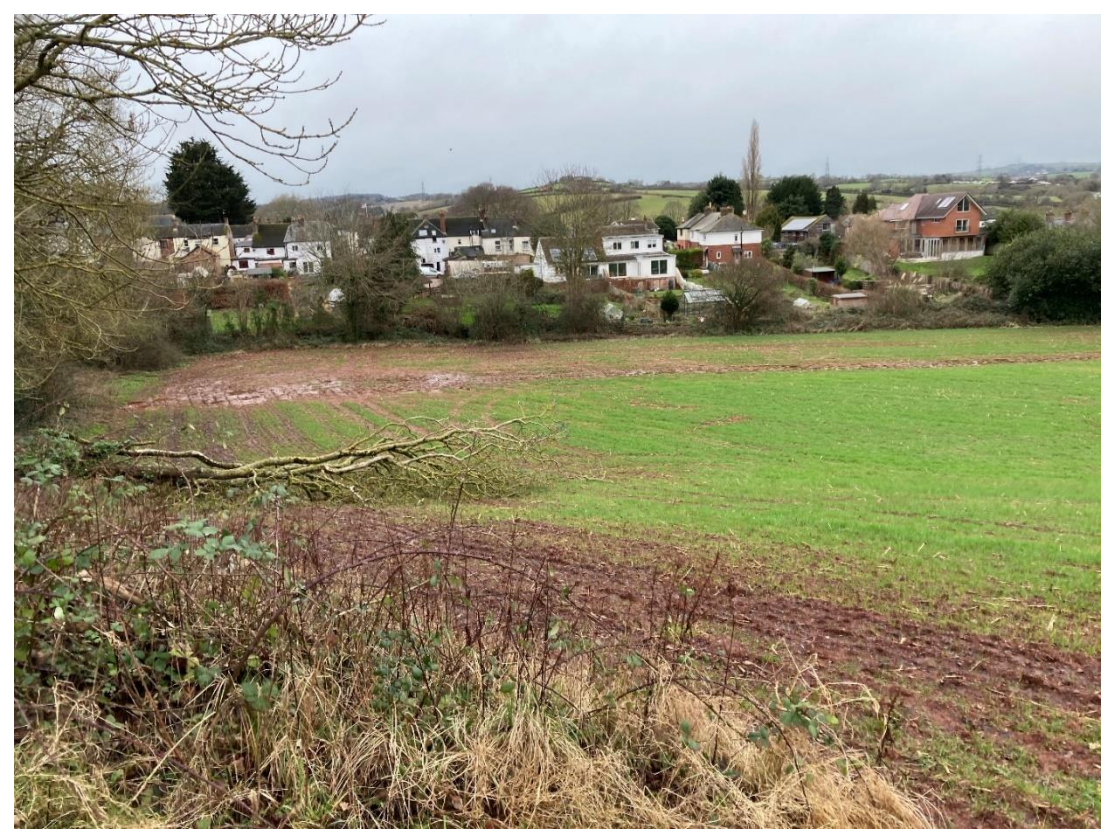
Figure 4- Picture of field 1