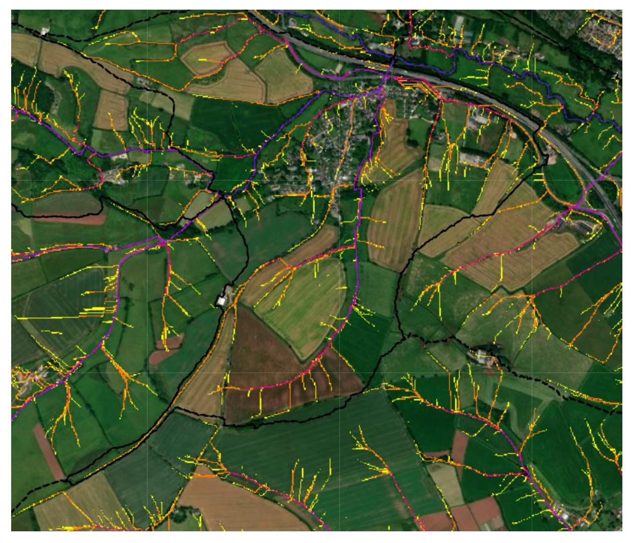
Figure 10- Aerial imagery showing theoretical overland flow pathways.