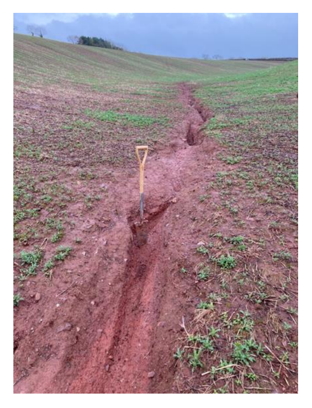
Figure 11- Field 2 erosion channel