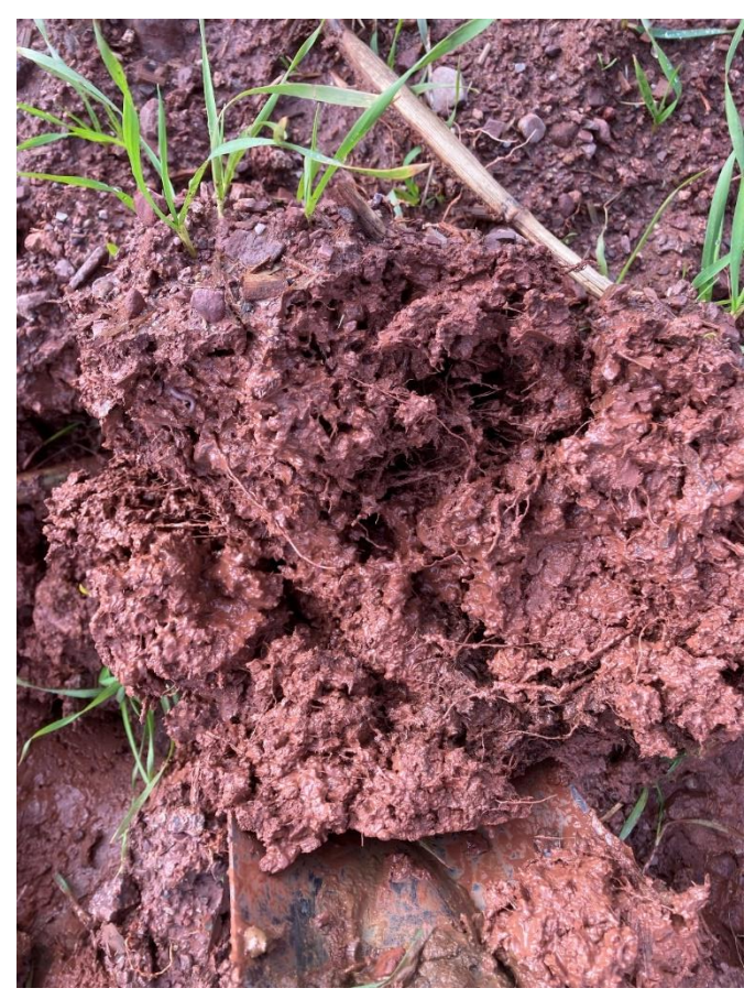
Figure 3- Soil sample field 1

Field 1 (Figure 4) Was a recently sown crop of winter wheat following maize. The established crop of winter wheat had good soil structure (Figure 3) and crop cover was emerging. There was no evidence of significant soil erosion and runoff, although the lower part of the field in the fluvial zone had been affected by fluvial flooding, where loosened maize stubble is at risk of being transported in flood waters. It was concluded that this field had good soil structure that would allow natural infiltration.