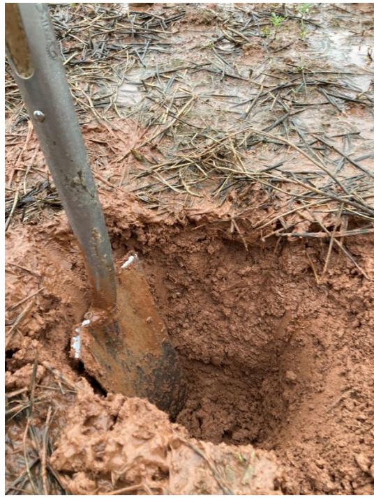
Figure 8- Soil assessment pit