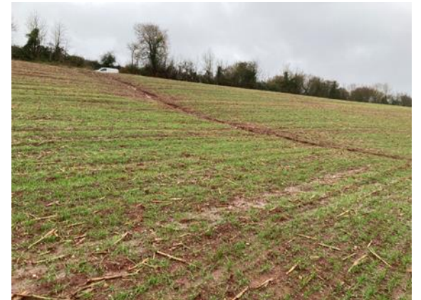
Figure 5- Picture of field 2

Following similar management to Field 1 the field had recently been sown to a crop of winter wheat following maize. Due to the nature of the recent cultivation this area had a loose friable structure with pore spaces to allow drainage and movement of air through the soil profile. This is likely to accept most winter rainfall. An area of erosion had been observed (Figures 5+6), where it is likely caused by the field accepting a significant flow of water from the drainage network from the local highway. Conversations with the land manager suggest there is drainage management required and formalisation of a suitable flow pathway through the field parcel.