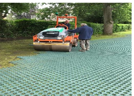
Roll one edge into the ground, then roll running DIAGONALLY