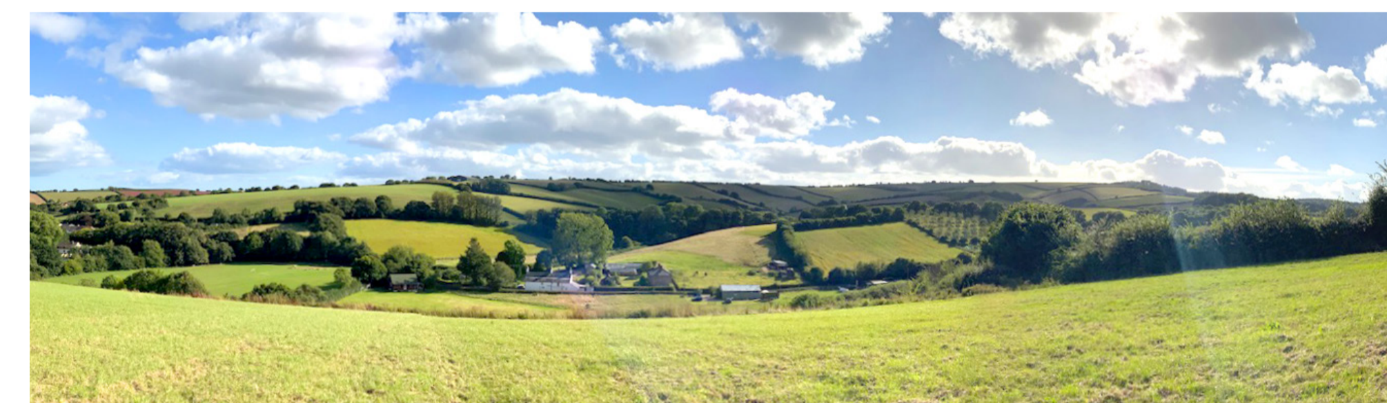
Fig.3 View south from the top of Northern Fields

Once the Stage 2 application is submitted in early November, we expect to hear back in Spring 2025 as to its success. Following this we will then explore our options for funding, with a view to hopefully start planting in the Winter of 2025/26.