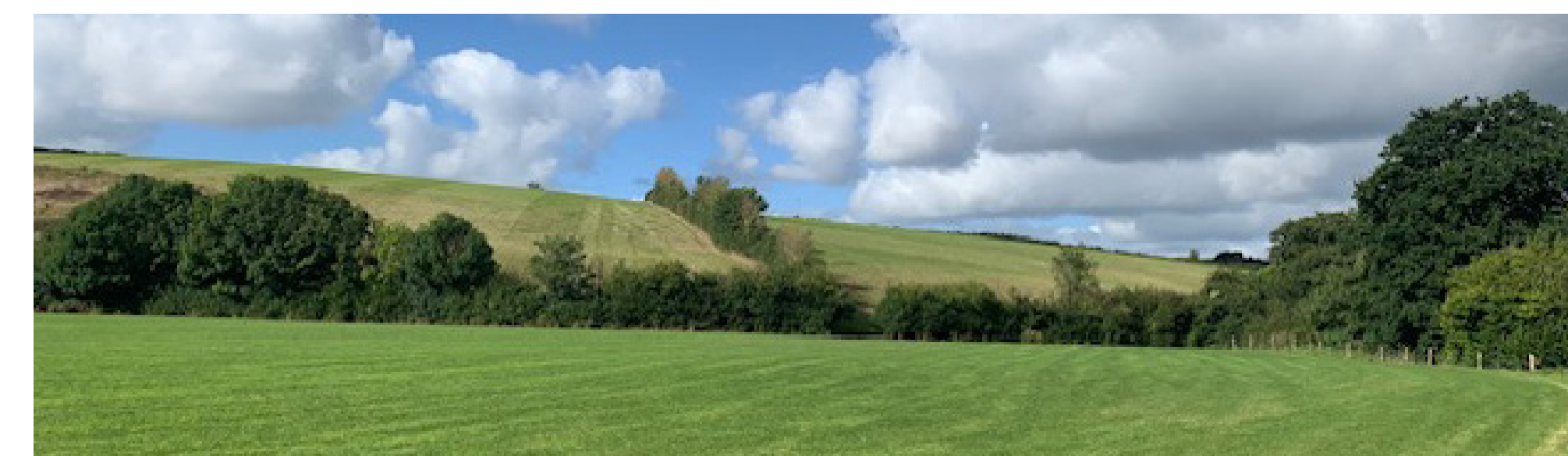
Fig.4 View of Northern Fields from Weir Meadow