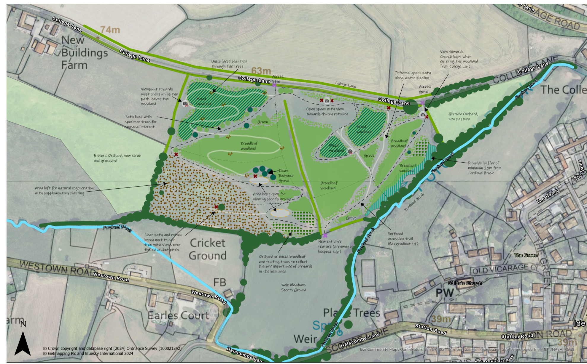
Fig.5 Concept Design