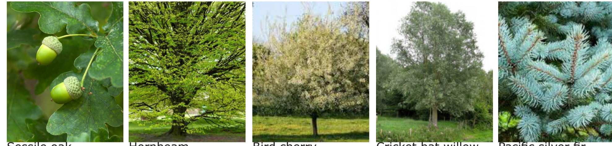
Fig.7 Examples of some of the tree species we plan to plant

Open space has been left to preserve historical features (WWII bomb craters) in the north of the site and to provide a viewing area for the sports field below.