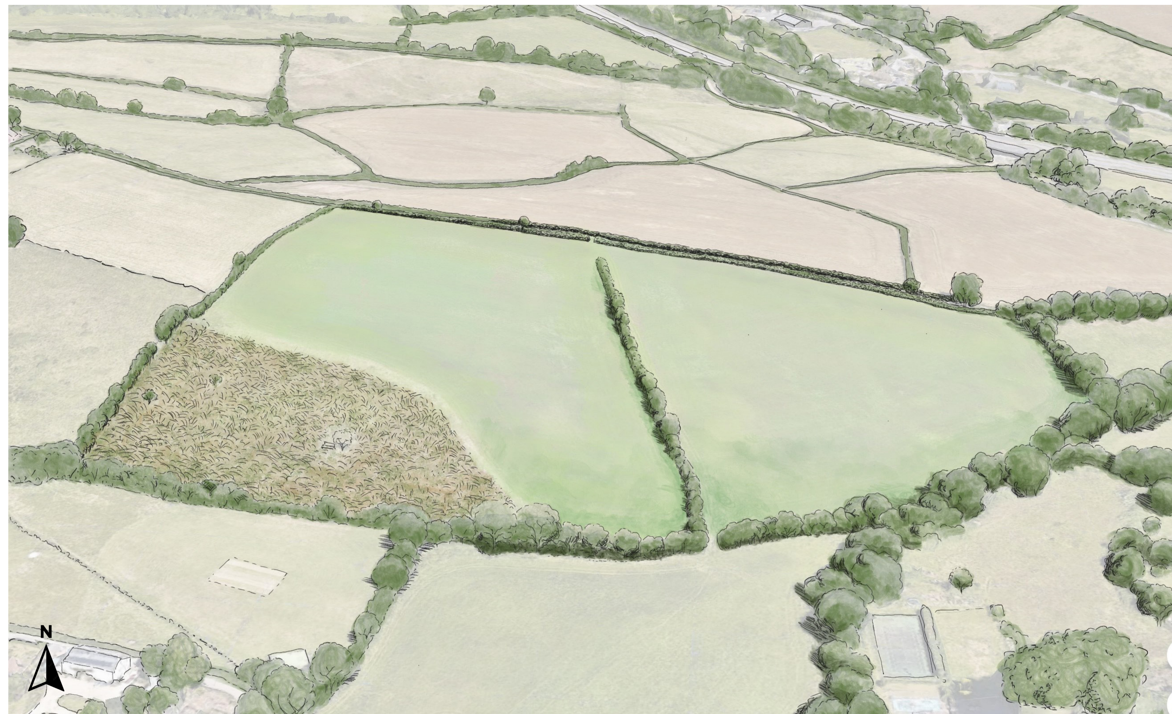
Fig.2 Artists Impression of the Existing Site

There is a rough grassland and scrub area, known as Oak Bank, where a few oak sapling have established themselves. There are also some fantastic views of St Ida's Church and along the valley to the west.